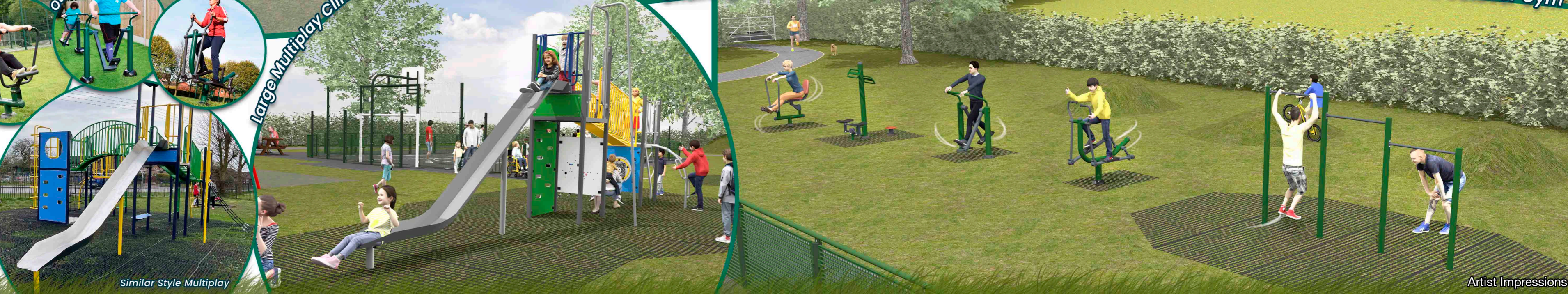
Similar Style Multiplay